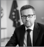
CARLOS MOEDAS Mayor of Lisbon